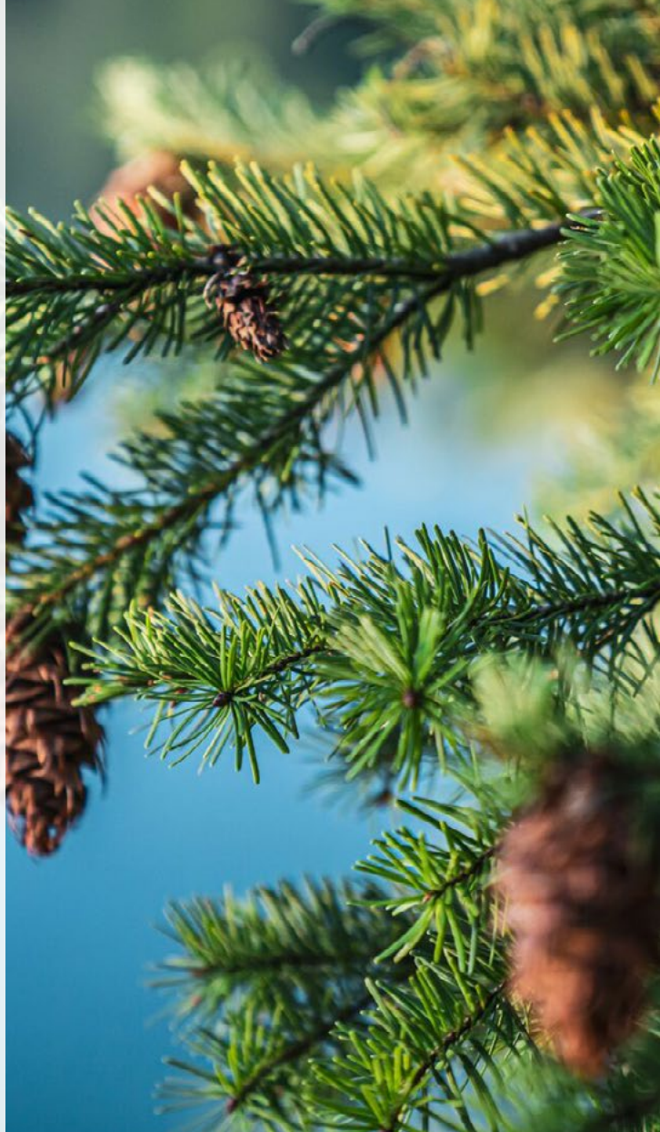
Douglas Fir Cones

The Farmland Advantage and Environmental Farm Plan Programs help farmers in BC to identify and preserve natural features on their land.