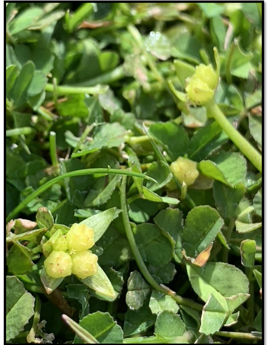
Macoun's Meadowfoam ( Limnanthes macounii ) red-list/Special Concern