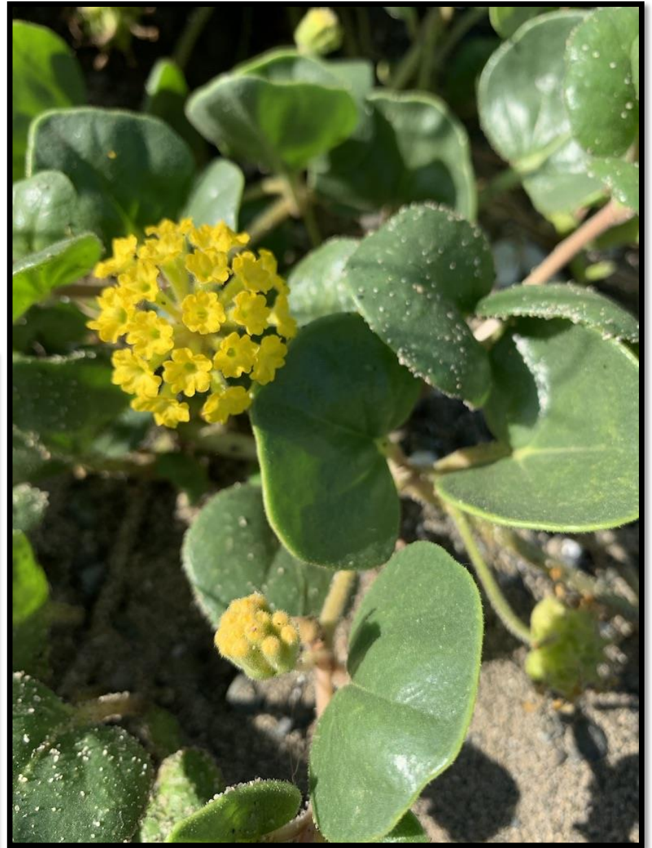
Sand Verbena Moth ( Copablepharon fuscum ) red-list/Endangered