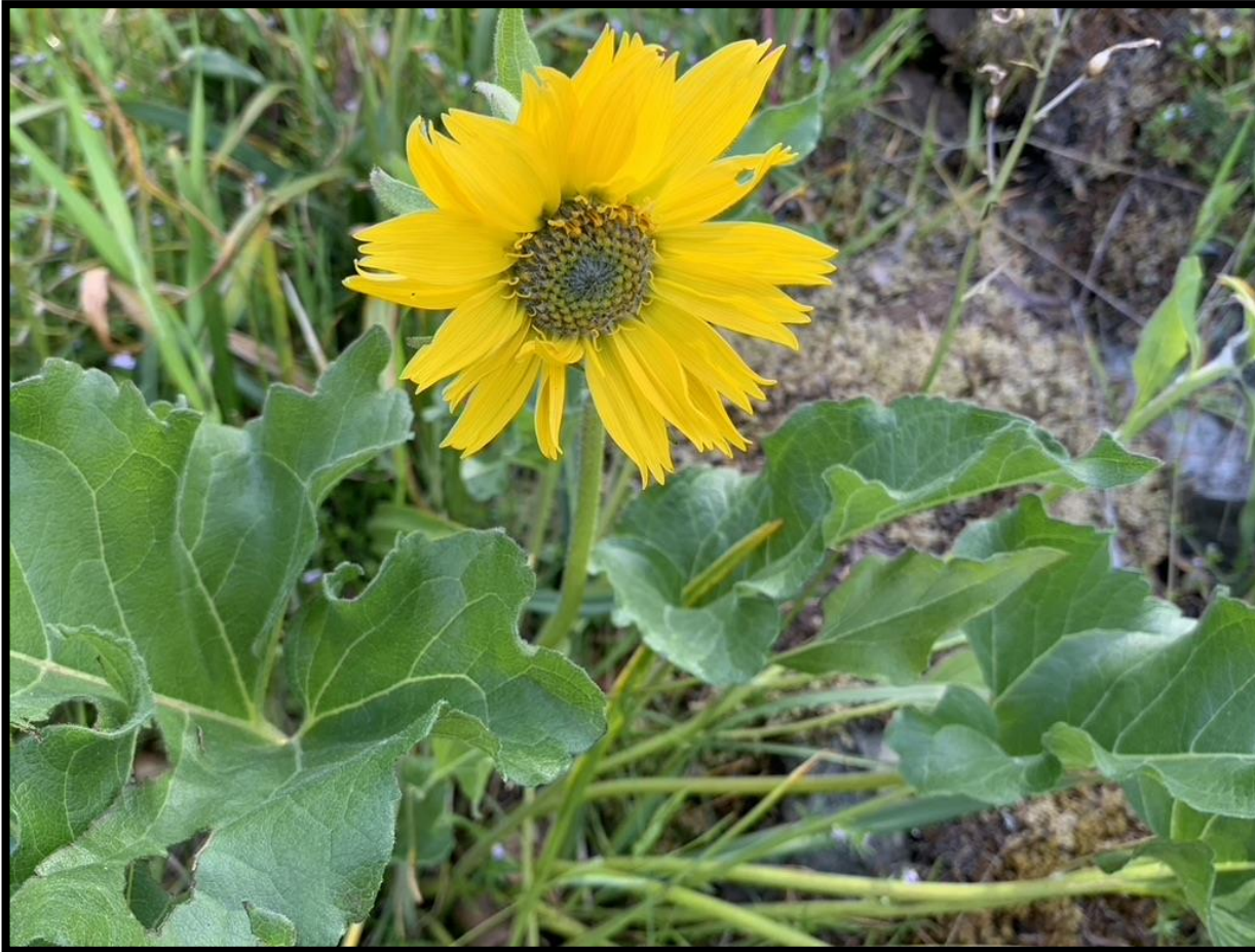
Deltoid Balsamroot ( Balsamorhiza deltoidea ) red-list/Endangered