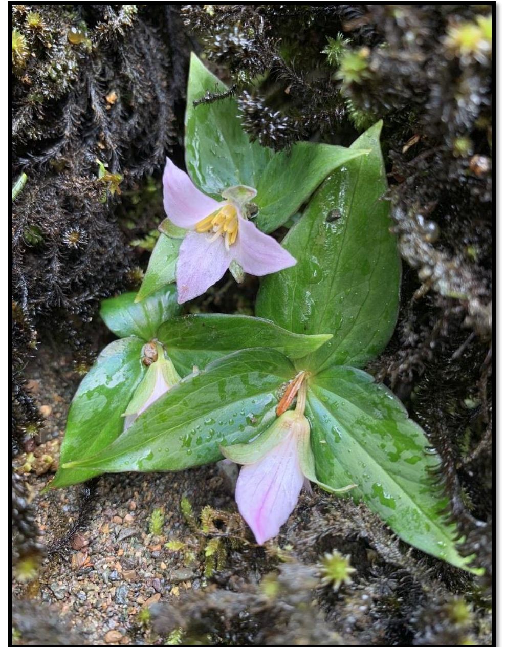
Hibberson's Trillium ( Trillium hibbersonii ) blue-list/Threatened