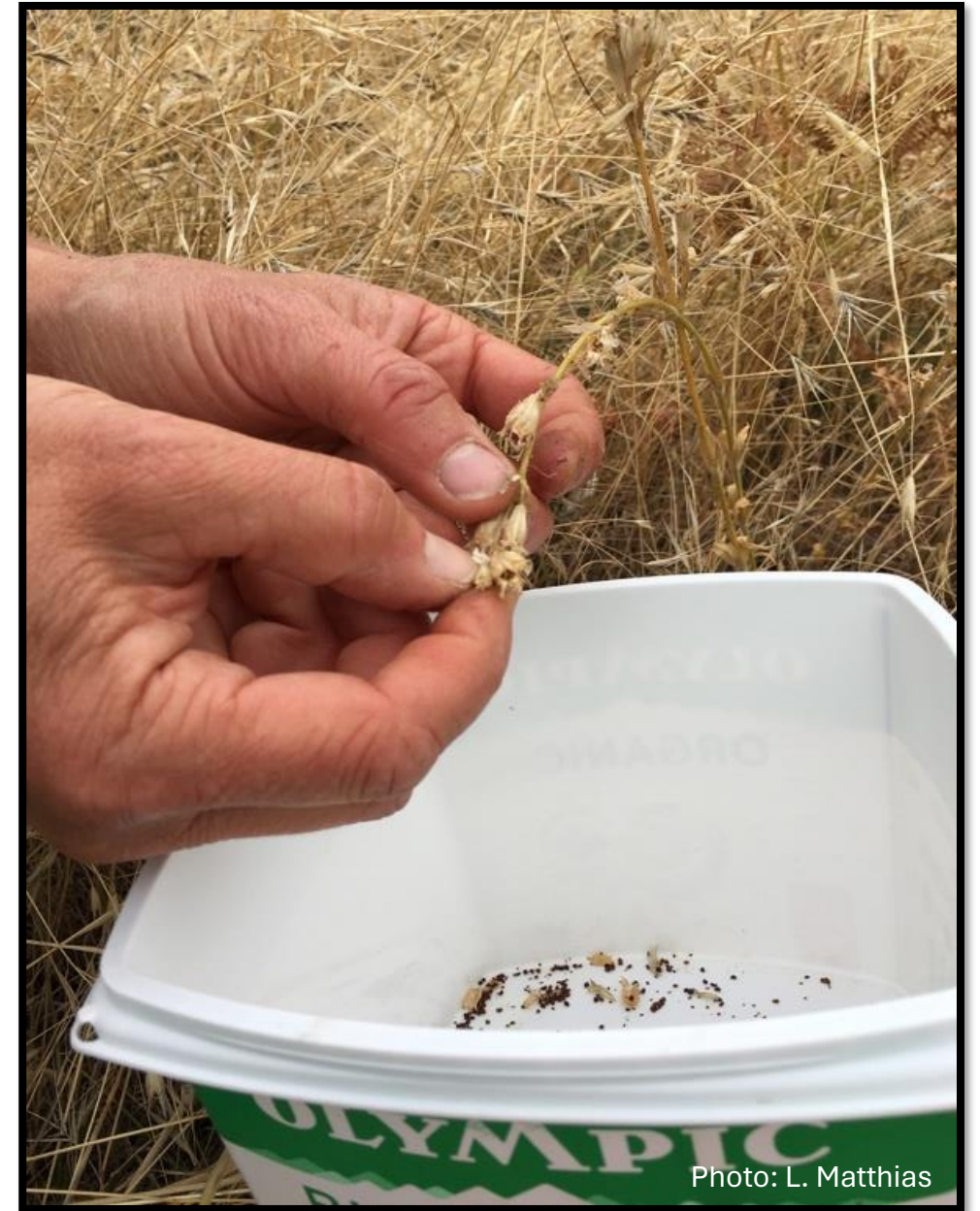
Coastal Scouler's Catchfly ( Silene scouleri ssp. scouleri ) red-list/Endangered