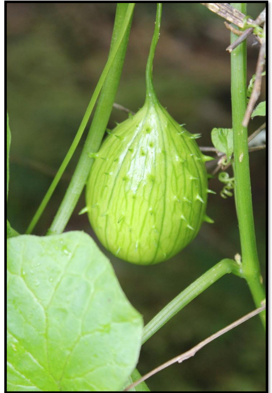
Coast Manroot ( Marah oreganus ) Red-list/Endangered