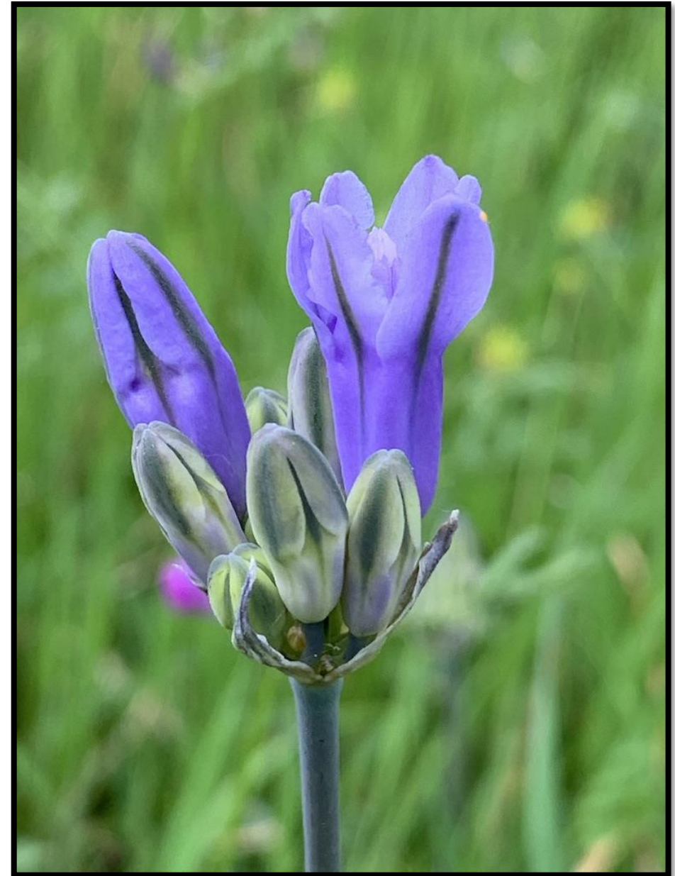
Howell's Triteleia ( Triteleia howellii ) red-list/Endangered