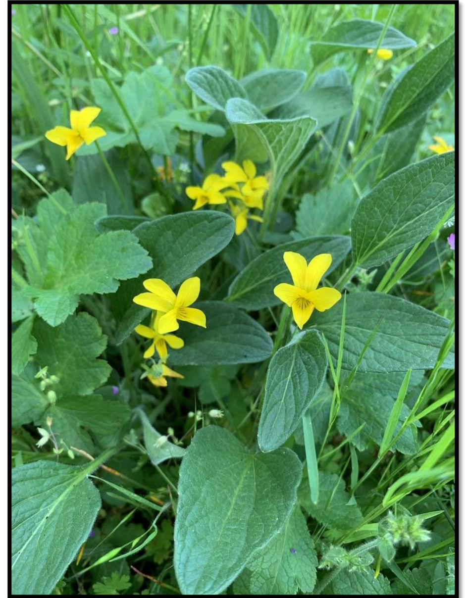
Yellow Montane Violet ( Viola praemorsa var. praemorsa ) red-list/Endangered