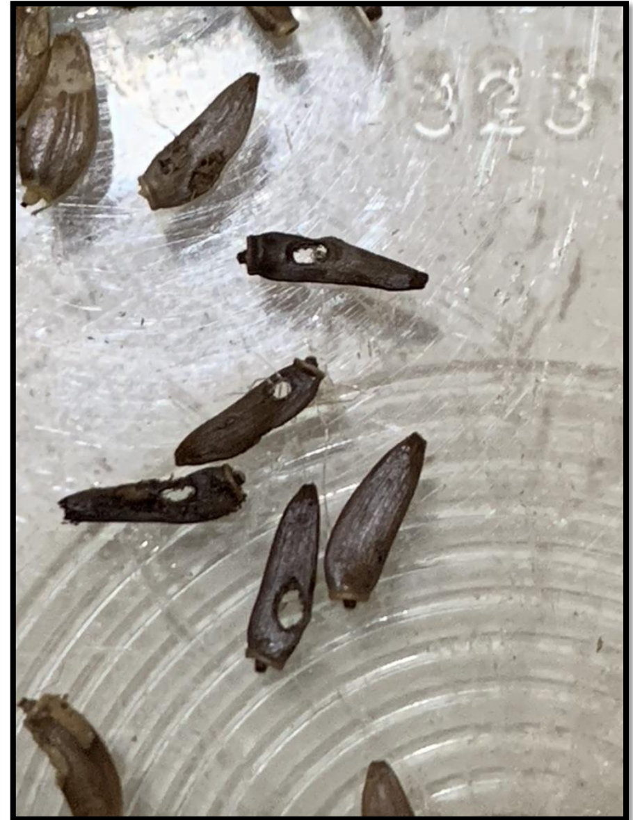
Meadow Thistle ( Cirsium scariosum var. scariosum )